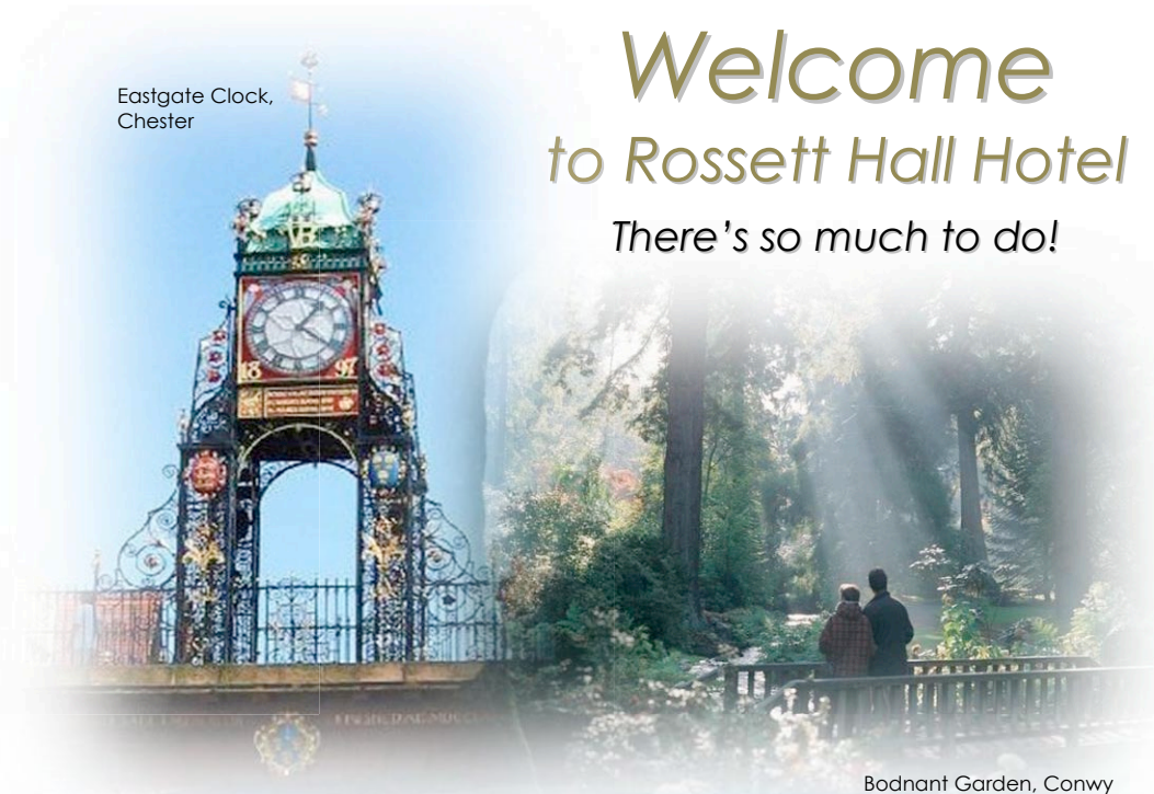
Eastgate Clock, Chester

Welcome to Rossett Hall Hotel There's so much to do!